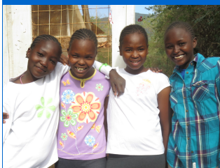
Some of the girls – BFF!