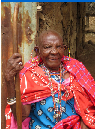
Visiting the elderly is always a favorite time

Join a team to live in a Maasai community and love on the kidz. Go to KenyasKidz.org for more information.